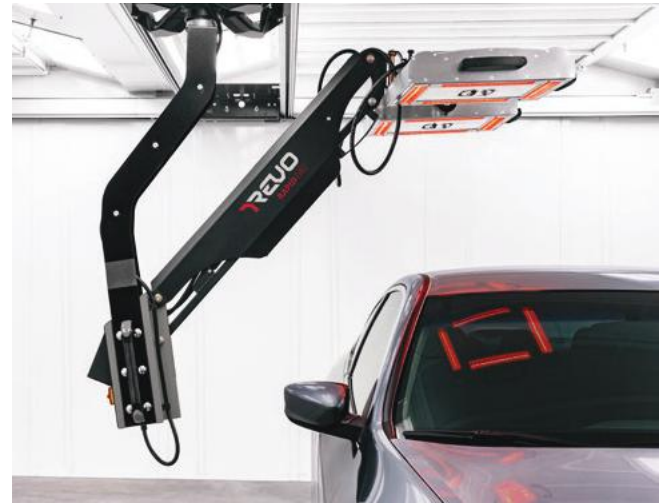
Cure primer on 2 panels in less than 11 minutes