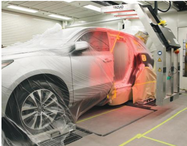
Complete body filler through clear coat in under 1 hour